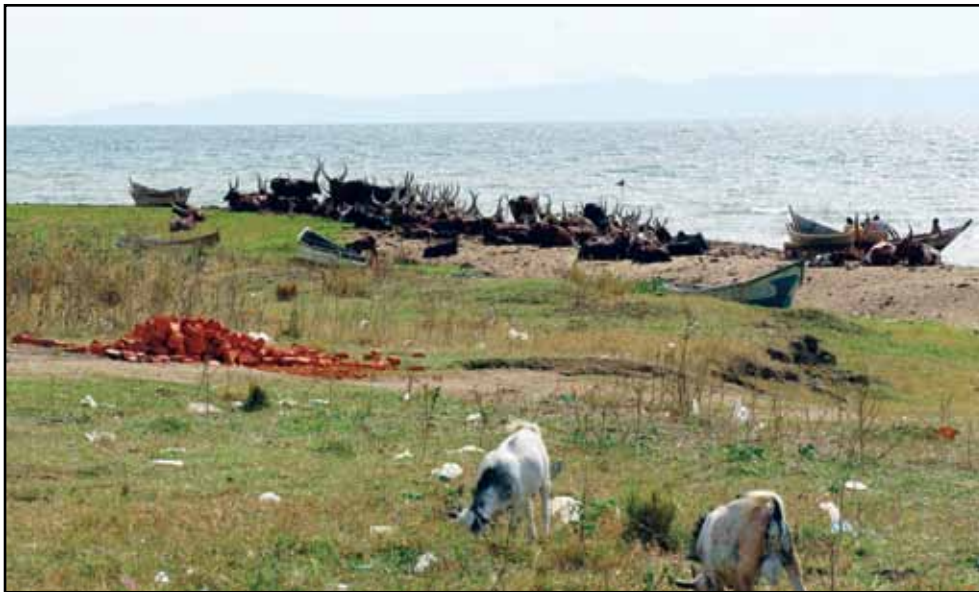
Signs of subsistence economics in the form of cattle, goats and fishing boats on the shore of Lake Albert, Tonya

Ancestral memory of life on the shore of Lake Albert stretches back for generations. This became clear during an interview with a LOCI representative. She described in some detail how ‘... my parents, grandparents, and too many generations to remember, all lived in this village.’ 92 She illustrated that although life on the lake may be tough, these are ancestral lands and the oil exploration activities have upset traditional economic practice. She said that the generations that precede her and her children ‘... all lived off the lake.’ 93 The lake is therefore much more than a static body of water for the people in Kaiso-Tonya. It is an integral part of ancestral memory while also providing the economic basis for survival. To make matters worse, she indicated that since the seismic studies were conducted in the vicinity of their village, fishermen have complained about dwindling catches. These complaints were echoed by several fishermen during the course of the fieldwork, who thought the seismic studies may have interfered with the fish breeding grounds, or the fish were scared off by the explosions and migrated to other parts of the lake. 94 Others, however, did not see a direct link between the seismic studies and dwindling fish stocks.