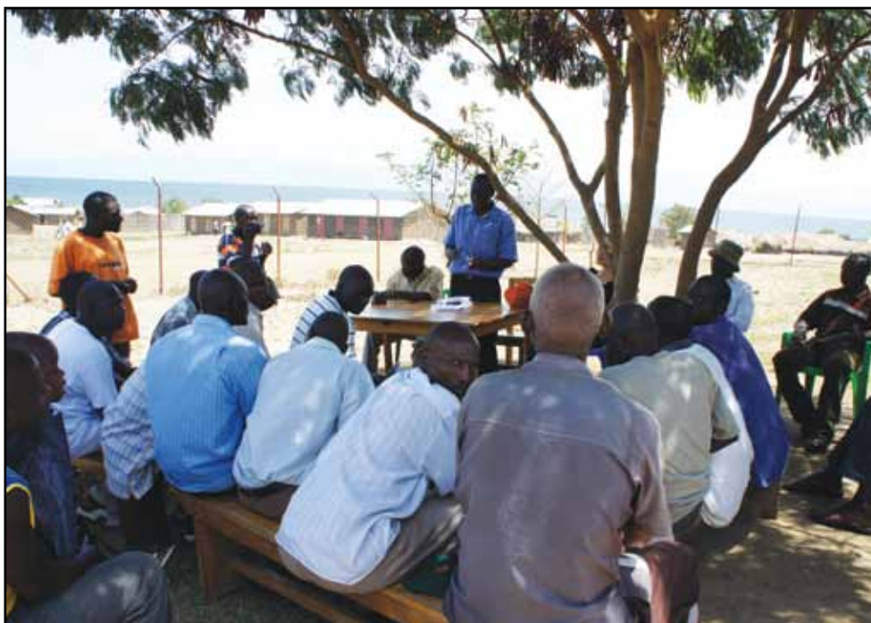
Publish What You Pay meeting, Ssebagoro

The CBO representative from Buliisa indicated that there is a solution to the problem of communal land ownership. Communities without title deeds have begun to organise communal land owners' associations. These associations document all the people living in a village or area owned communally, and then register the land in their names. 65 However, NAVODA has stated that the cost of registering land is too high, at an estimated UGX 66 3 million (approximately $1,300), 67 and makes poor subsistence farmers and fishermen unable to afford this.