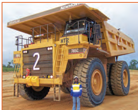
Female employee of Newmont Mining Corporation

For many countries, extractive industries (EI) are a major economic driver: creating jobs, revenue, and opportunities for growth and development. There are also risks associated with EI, in terms of social and economic upheaval and environmental harm. The impacts of these benefits and risks are often considered only at the community level, without exploring how they are allocated within the community. World Bank consultations with different